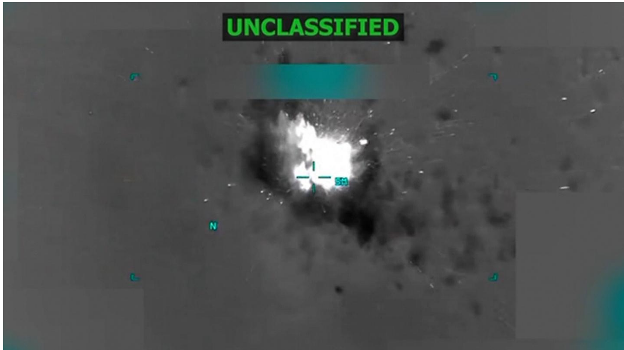
“An image from a video released by President Donald Trump on his Truth Social account, claims to show a lethal kinetic strike on a vessel just off the Coast of Venezuela, Oct. 14, 2025.”

We know that in the “fog of war,” and under the extreme stress of combat, these laws of human decency are sometimes violated. Even extreme cases of ruthless massacres such as that at My Lai in the Vietnam War, have occurred. The U.S. military has struggled for a half century to overcome that one by becoming as ‘professionalized’ as possible. Oops! The Abu Ghraib torture and prisoner abuse scandal in the war on Iraq too. But those past failures were not official policies sent down from the highest authority.